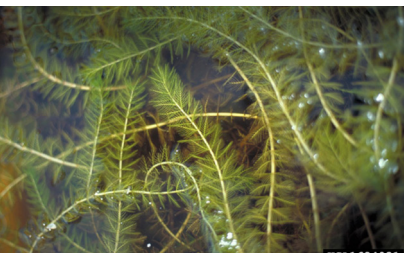
Eurasian watermilfoil